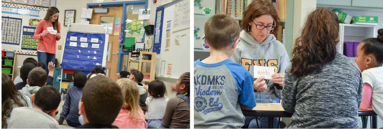
Teachers in Bethlehem, Pennsylvania, use a curriculum that mixes teacher-directed whole-class phonics lessons with small-group activities.