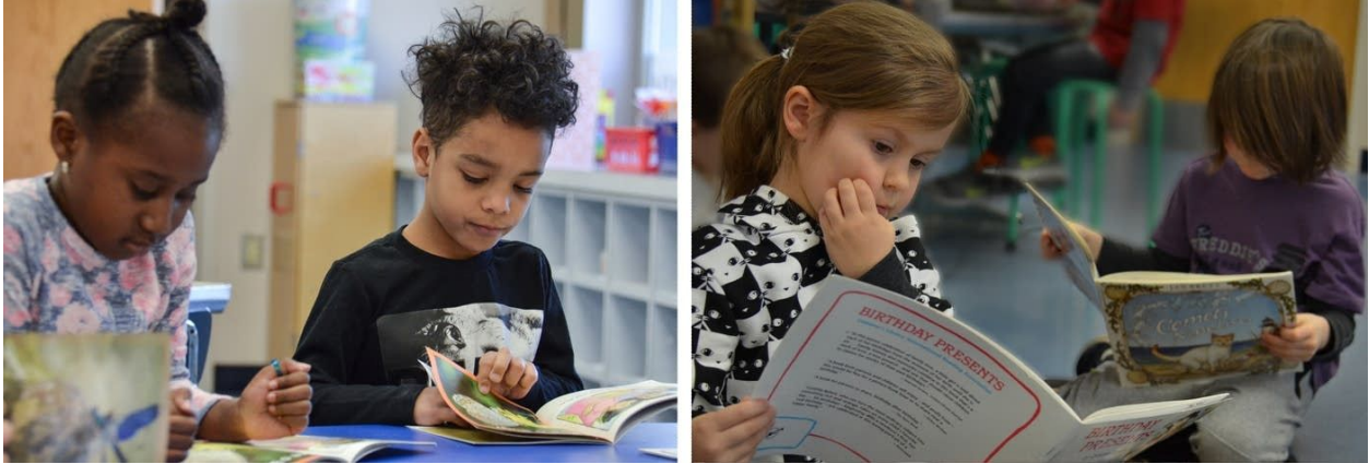
Kindergartners in Bethlehem, Pennsylvania.