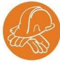
Building Trades and Construction