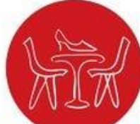
Fashion & Interior Design