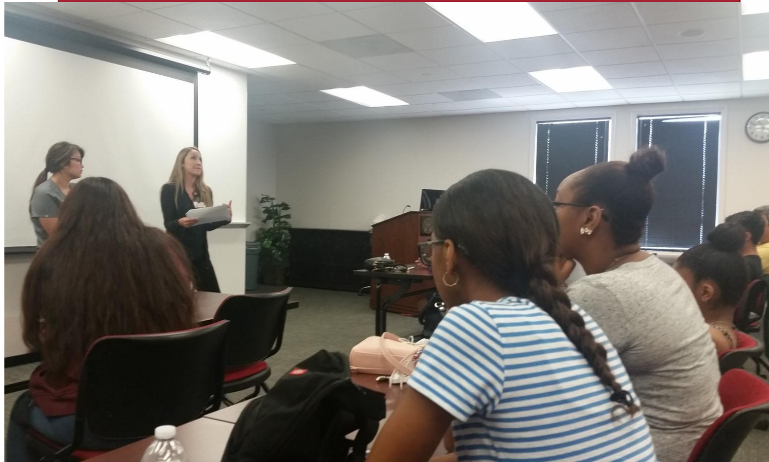
USC Keck Medical School Physician's Assistant Pipeline Program, 2018