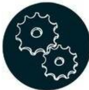
Manufacturing & Product Development