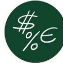
Finance and Business