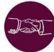
Marketing, Sales, & Service