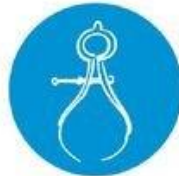
Engineering & Design Industry