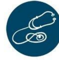
Health Science & Medical Technology